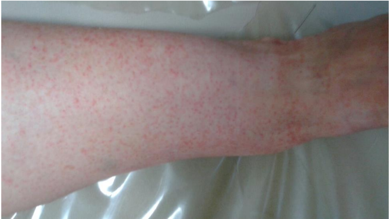
Figure 1 above shows the patients lower left leg and ankle in anterior view. Scattered raised petechial red spots are on the skin, and the indentation of the skin at the just removed stocking shows significant edema at the location of the ankle bones. This is a pre-acupuncture picture on day 3.

this case a depressed liver which invaded the spleen. 6 Chinese medical treatment would have to reduce the dampness and heat as well as restore balance between the liver and spleen. 9