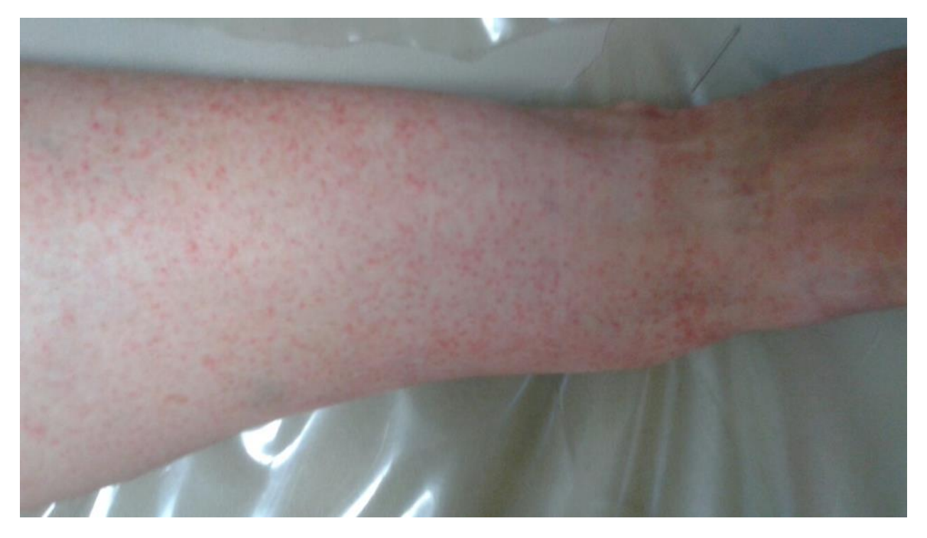
Figure 1 above shows the patients lower left leg and ankle in anterior view. Scattered raised petechial red spots are on the skin, and the indentation of the skin at the just removed stocking shows significant edema at the location of the ankle bones. This is a pre-acupuncture picture on day 3.

this case a depressed liver which invaded the spleen. <sup>6</sup> Chinese medical treatment would have to reduce the dampness and heat as well as restore balance between the liver and spleen. <sup>9</sup>